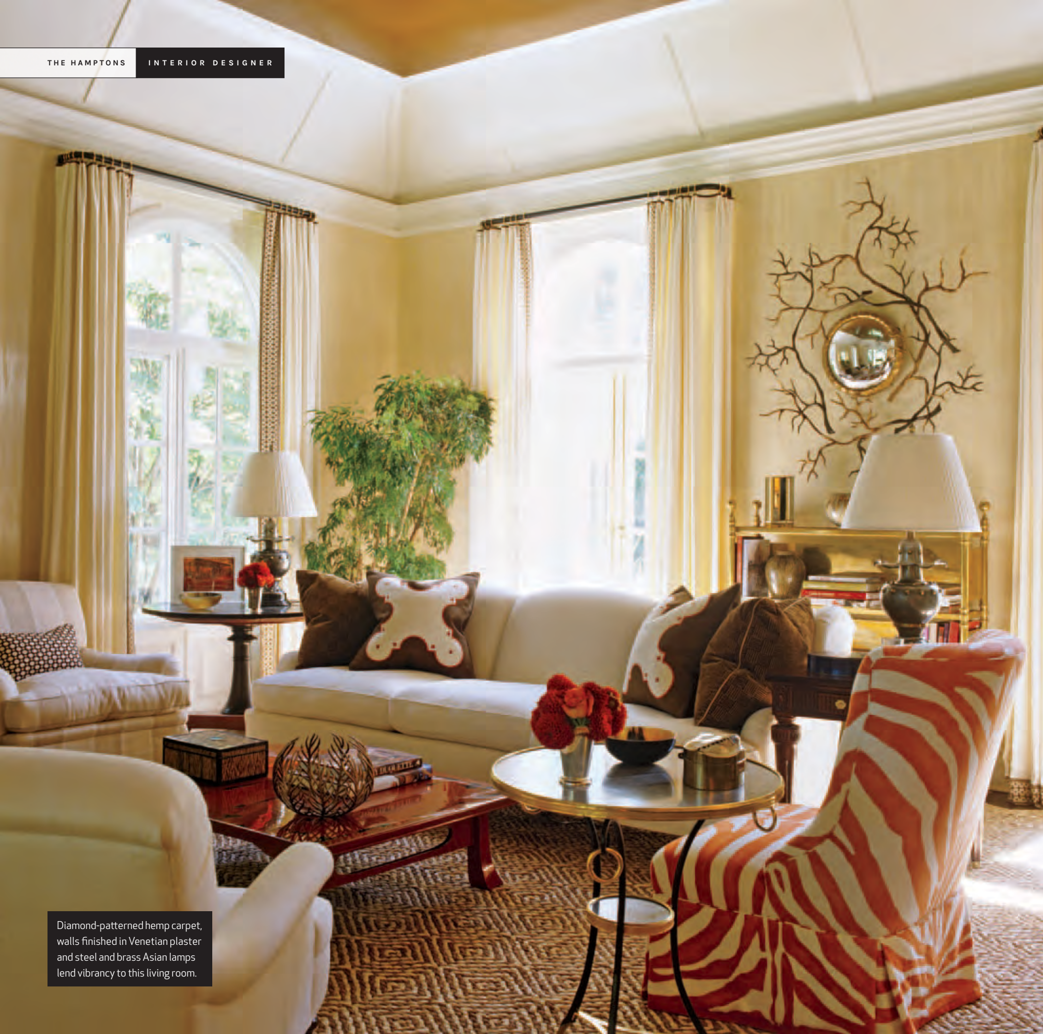
Diamond-patterned hemp carpet, walls finished in Venetian plaster and steel and brass Asian lamps lend vibrancy to this living room.

Window frames and trim in the master bedroom were painted a shade of ash to articulate the space's architecture.