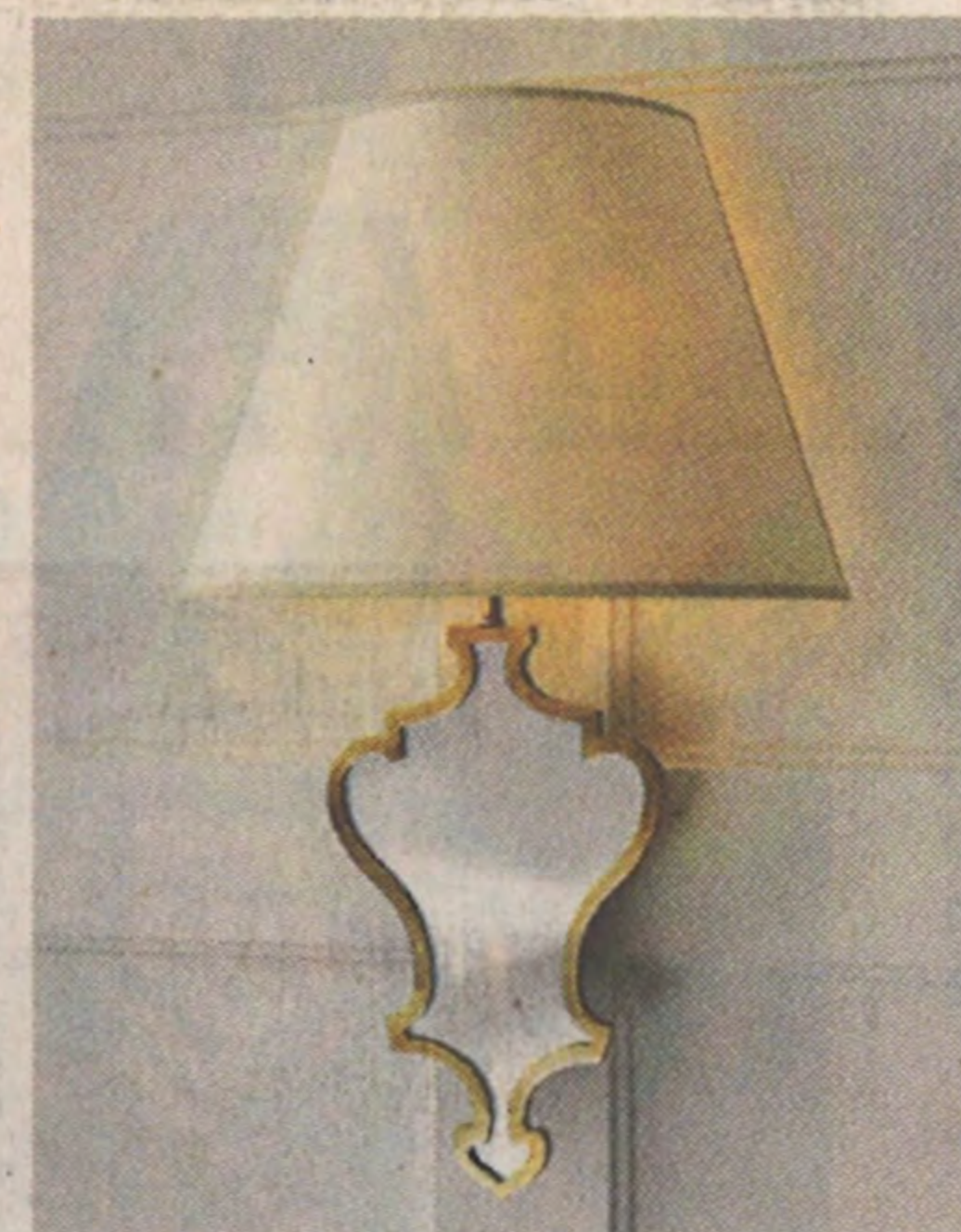
Madeline sconce by Visual Comfort; $395 at Gracious Home, (800) 338-7809, gracioushome.com .