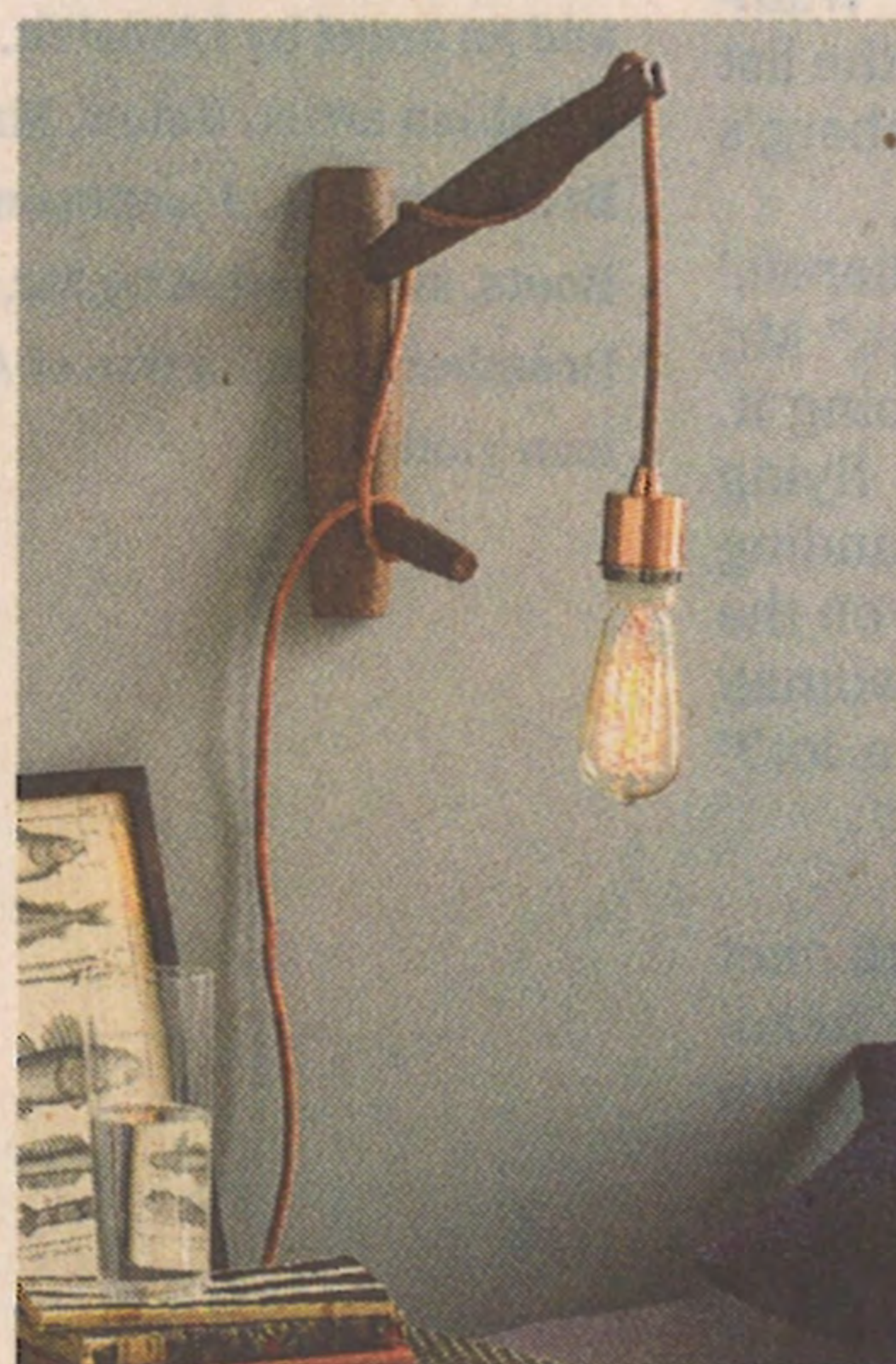
Angler Sconce; $24 at West Elm, (888) 922-4119, westelm.com .