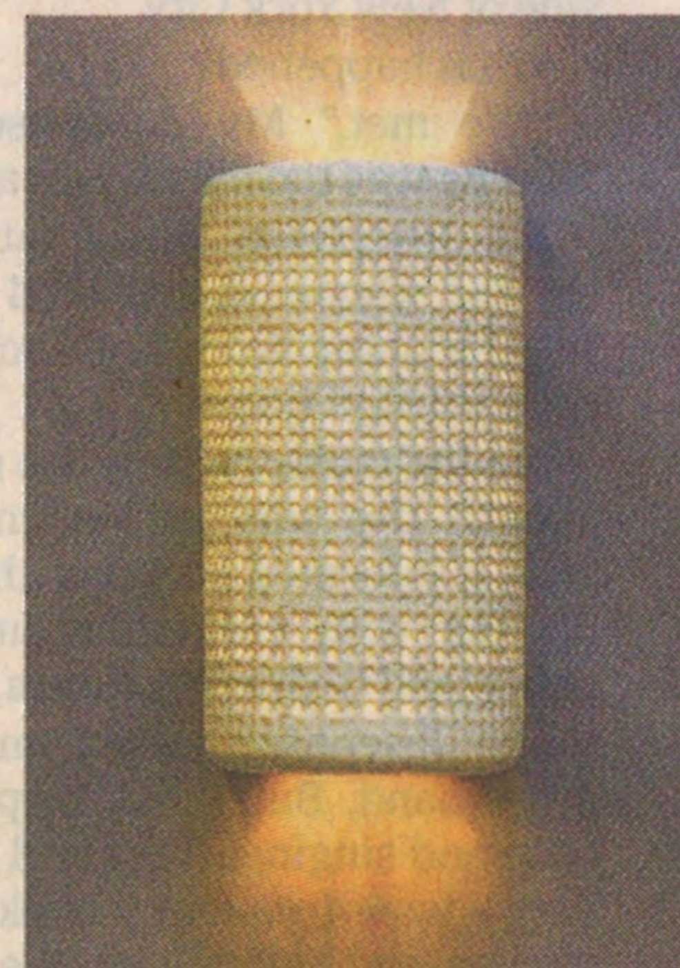
Sconce by Scott Daniel Design; $975 each at Bespoke Global, (212) 537-0112, bespokeglobal.com .