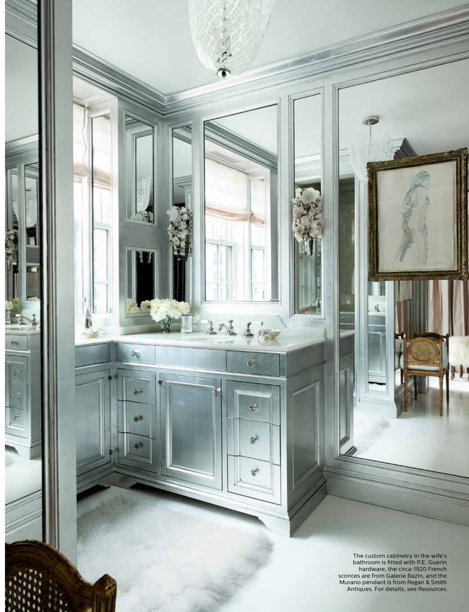
The custom cabinetry in the wife's bathroom is fitted with P.E. Guerin hardware, the circa-1920 French sconces are from Galerie Bazin, and the Murano pendant is from Regan & Smith Antiques. For details, see Resources.