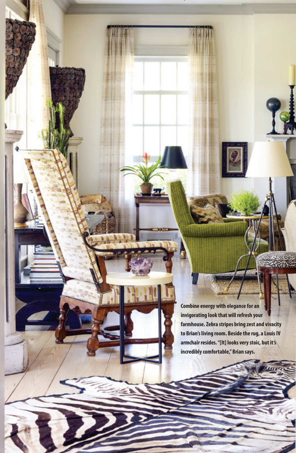
Combine energy with elegance for an invigorating look that will refresh your farmhouse. Zebra stripes bring zest and vivacity to Brian's living room. Beside the rug, a Louis XV armchair resides. "[It] looks very stoic, but it's incredibly comfortable," Brian says.

"Our place expresses that curious sensibility. It's always evolving, and some things work better than others—but in a way, that's what makes it home."