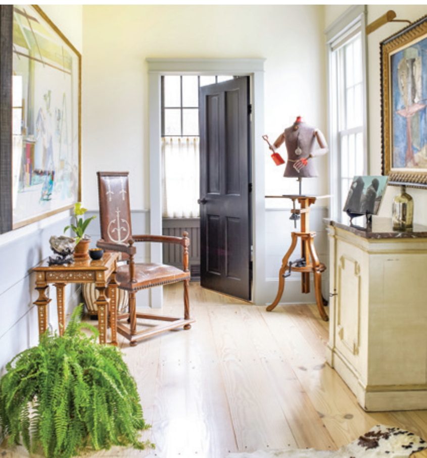
(left, bottom) Introduce quirky objects like this American sculpture to make a statement in your entryway. Not only is the piece eye-catching, but it also sets the tone for the rest of the home, which features a tidy art collection.