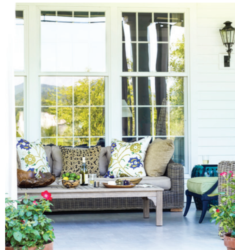
Freshen your outdoor furniture with floral patterns. These happy patterns bring a pop of color to the portico, delightfully contrasting the deep brown sofa cushions. And, of course, wicker is the perfect summer seating choice for the American farmhouse.